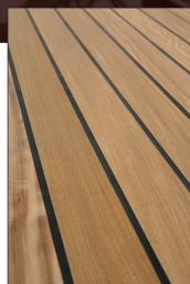
with joint strip