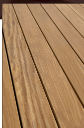
without joint strip